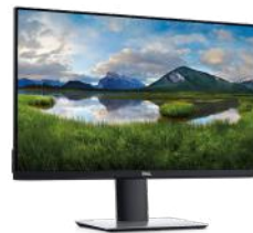
DELL 27 USB-C MONITOR | P2720DC

Easily attach your Dell Dock to the Dell Dock Mounting Kit and mount it behind a monitor, to a wall or under the desk for a clutter-free workspace.