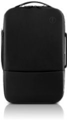
DELL PRO HYBRID BRIEFCASE BACKPACK 15 | PO1520HB

Protect your laptop from impact with this earth friendly backpack that is lined with EVA foam cushioning. Easily convert from backpack to briefcase mode and travel with ease.