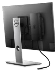
DELL DOCKING STATION MOUNTING KIT | MK15

Work at full speed with Dell's powerful Thunderbolt Dock. Charge your system faster, support up to two 4K displays and connect to your peripherals via a single cable.