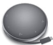
DELL MOBILE SPEAKERPHONE | MH3021P

Designed to work seamlessly across 3 devices, this compact keyboard mouse combo keeps your desk clutter-free and lets you stay productive with up to 36 months 25 of battery life.