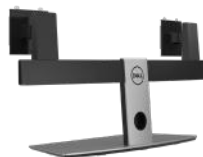
DELL DUAL MONITOR STAND | MDS19

Multiport with integrated speakerphone offers an all-in-one connectivity and conferencing solution.