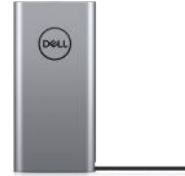
DELL NOTEBOOK POWER BANK PLUS - USB C, 65 WH | PW7018LC

Compact and portable 7-in-1 USB-C mobile adapter provides superb video, data connectivity and up to 90W power pass-through to your PC.